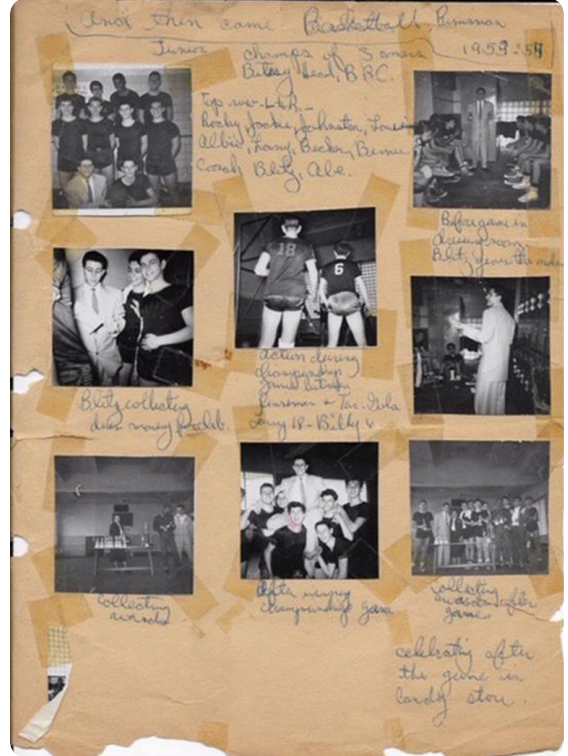
These are pictures I am putting in a new book about Brooklyn Under coach Blitz